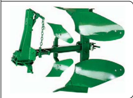
Model LM 30 HP

The Lacasta plough line, with a long tradition, is designed for low power, articulated and fixed tractors. Great soil penetration capacity with minimum total weight favours power savings.